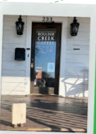
Relaxing at Boulder Creek Coffee