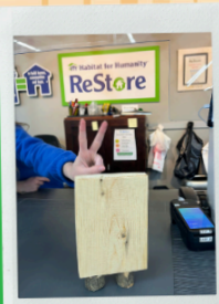
Shopping at ReStore

Stud's been ...checking in Volunteers in Monroe, shopping at the ReStore, getting coffee in Lawrenceville. Where else will Stud show up?