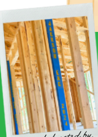
A stud donated by Jackson EMC