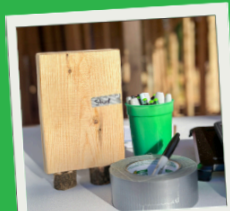
Volunteering in Monroe