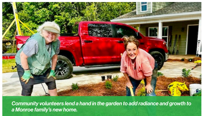
Community volunteers lend a hand in the garden to add radiance and growth to a Monroe family's new home.